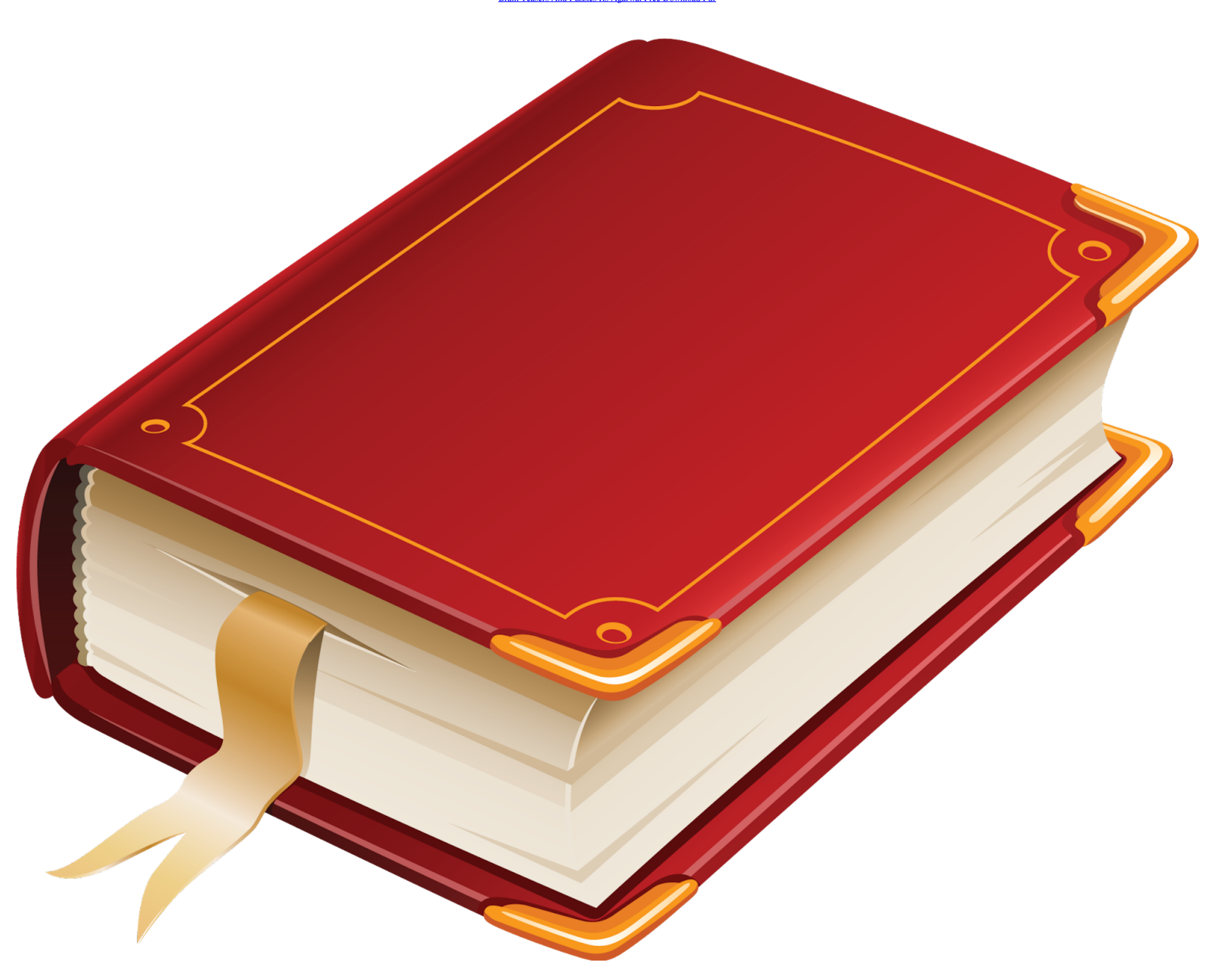
Brain Teasers And Puzzles Rs Agarwal Free Download Pdf